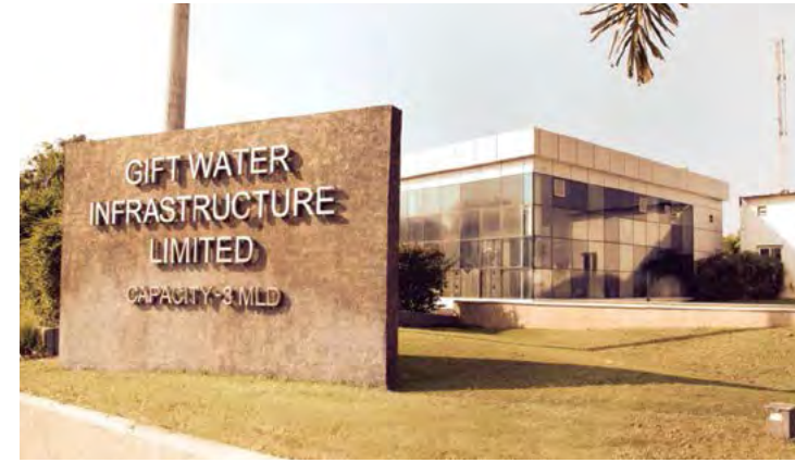
Water and Sewage System