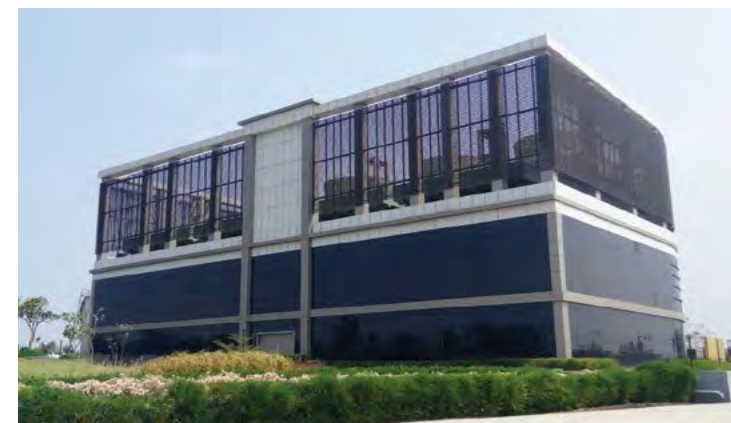
Energy Saving Enabled by District Cooling System (DCS)