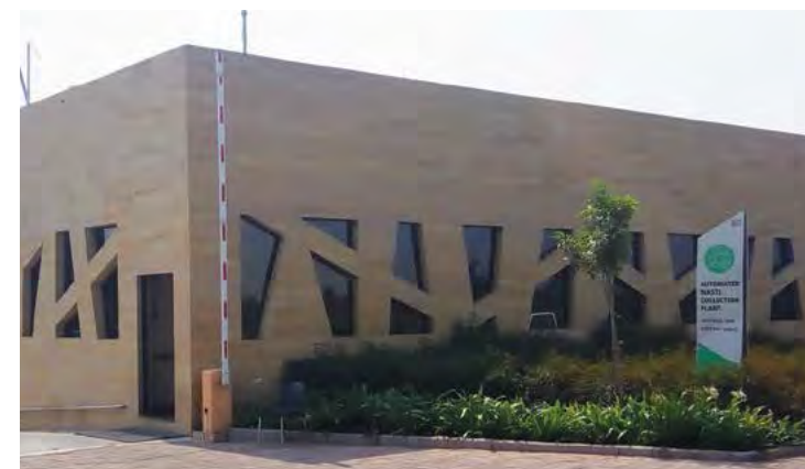
Solid Waste Management