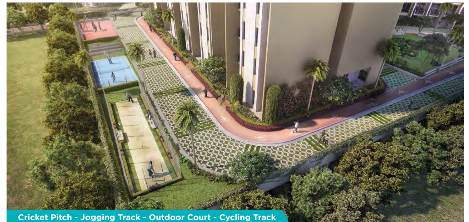
Cricket Pitch - Jogging Track - Outdoor Court - Cycling Track