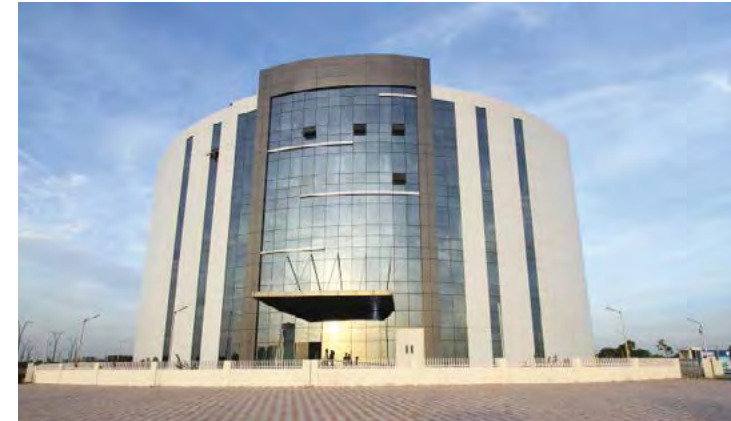
Information and Communication Technology