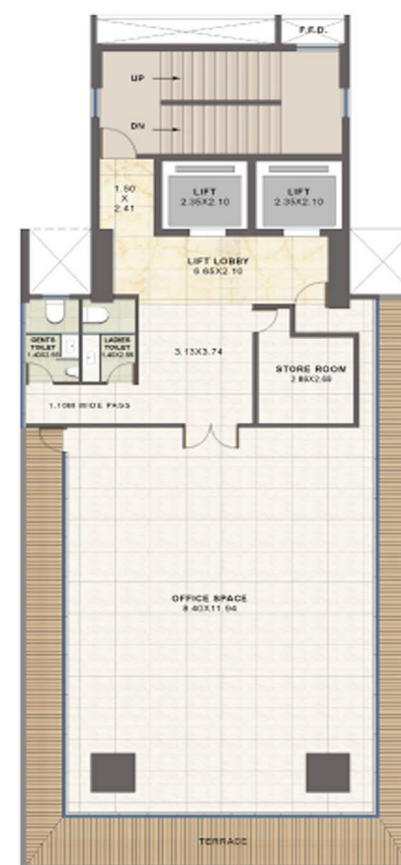
Fourteenth Floor Plan