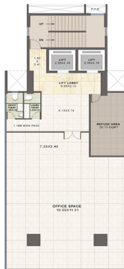
Twelfth Floor Plan