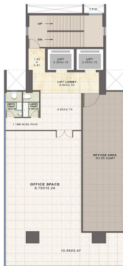
Fifth Floor Plan