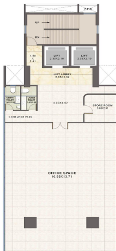
Typical Floor Plan (2, 3, 4, 6, 7, 8, 9, 10, 11 & 13 Floor)